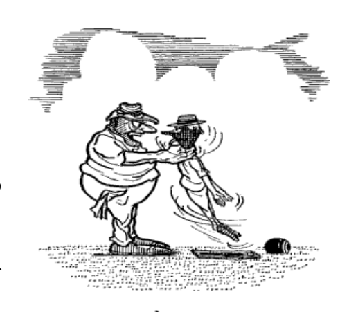
" BEFORE WE START LET'S GET THINGS STRAIGHT — AS MY LEAD YOU KNOW NOTHING, AND YOU SAY NOTHING!"

The head must not be disturbed by any player until the shots have been finally agreed. When the number threes or skips are deciding the shots the other player should stand well back from the head and give them space.